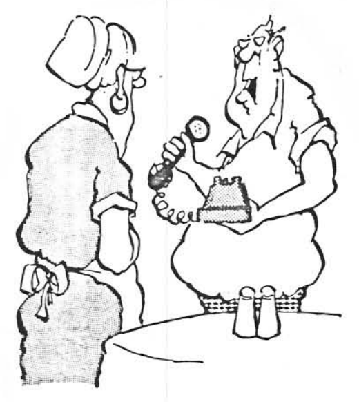
"Your mother went jogging and got a ticket for 'malicious damage' to the sidewalk."

49:26. Masters mile (men over 40 and women over 35): Alf Groom 5:03 and Rosemary Faulkner 6:45.