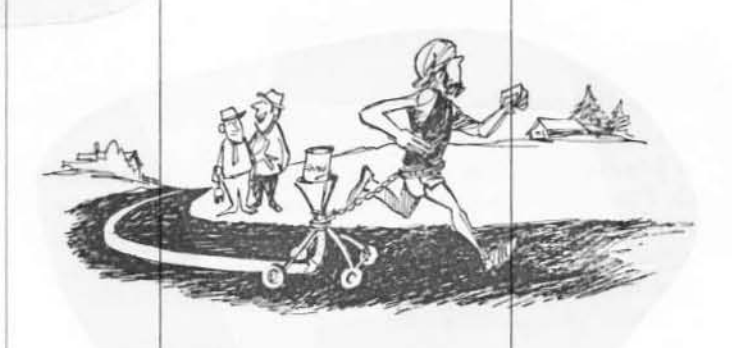
"And he gets paid by the mile!"