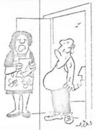
"You're logging shoes have been recalled."